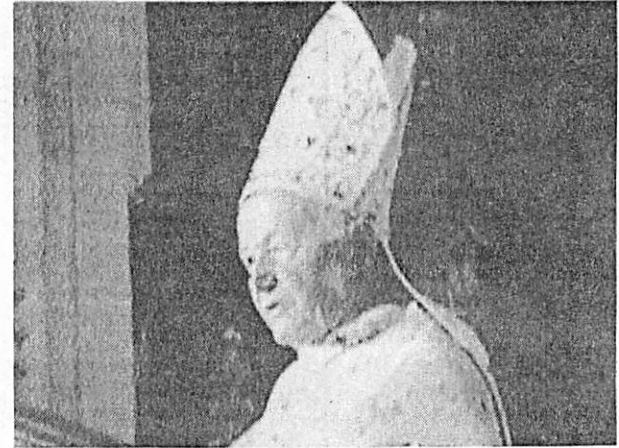
Alfons Cardinal Stickler delivering his Homily at Saint Patrick's Cathedral, May 12, 1996

Catholics should be especially grateful to Alfons Cardinal Stickler. Readers will remember Cardinal Stickler's superb speech "The Theological Attractiveness of the Tridentine Mass" that appeared in the July, 1995 issue of Catholic Family News . Cardinal Stickler obviously has a great love for the Tridentine Mass. At 85 years of age, he will travel to various parts of the world to